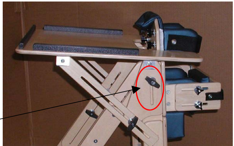
Tray in lowest position

Loosen the knobs on each side of the tray assembly to change the incline of the tray.