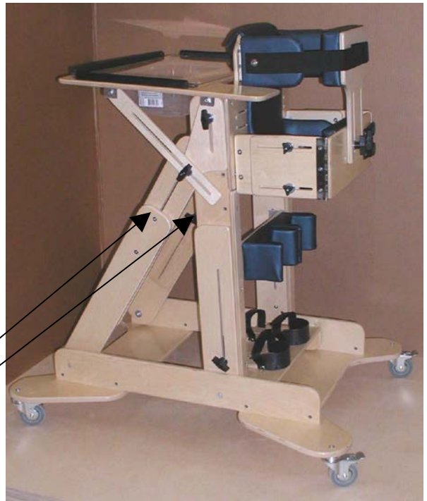
Stander in the upright position