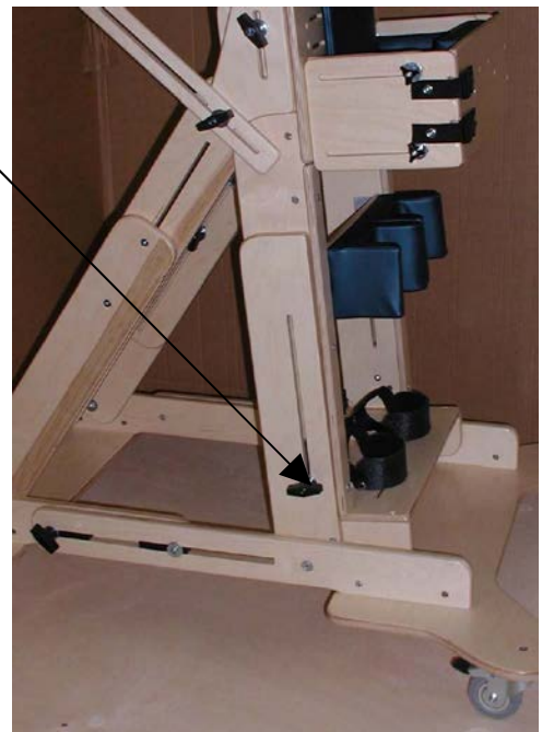
Stander at lowest height