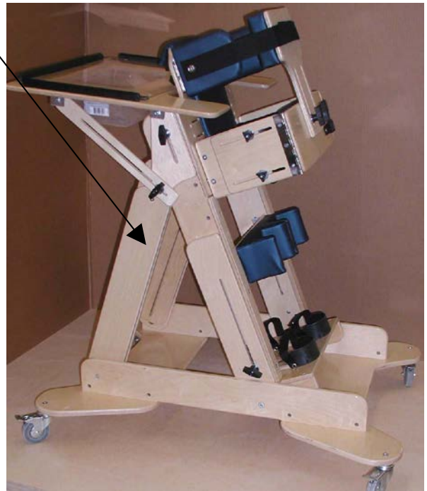
Stander with maximum forward tilt